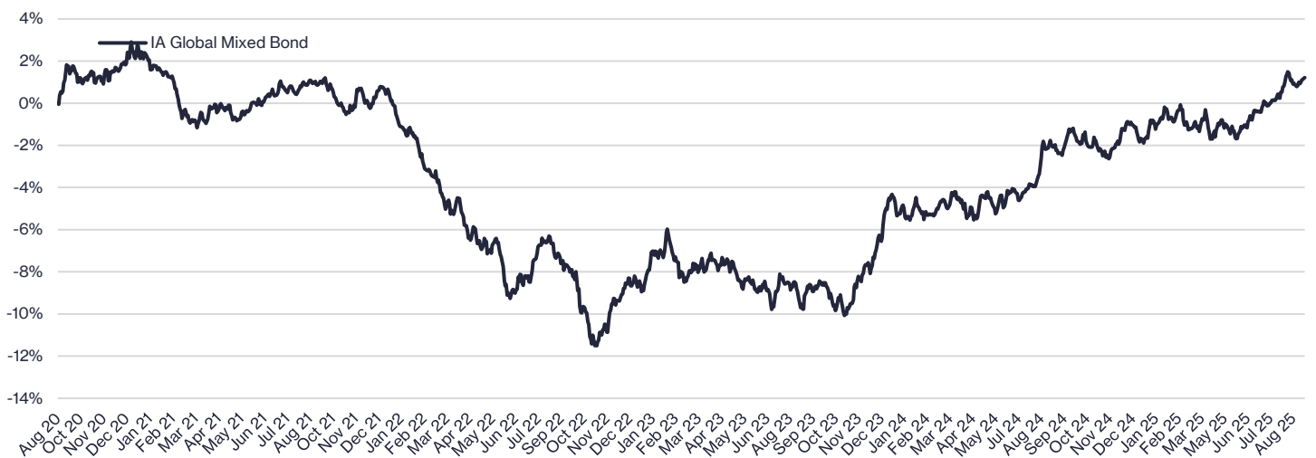
Source: Morningstar Direct as at 29 August 2025. Performance is bid to bid with income reinvested. Past Performance is no guarantee of future performance and investors may get back less than the original amount invested.