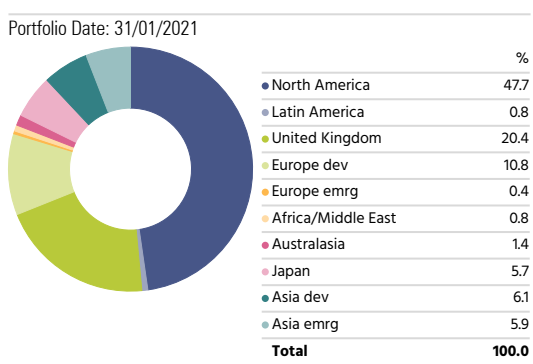
mno 20 Equity Contare (Marningstor)